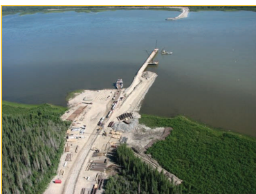
Photo: Deh Cho Bridge Construction at the Mackenzie River near Fort Providence, Northwest Territories